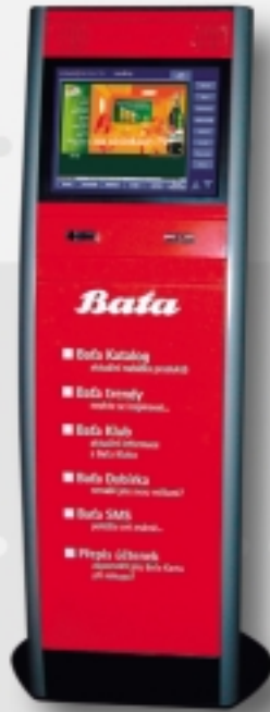
< Eagle with Customized Graphics