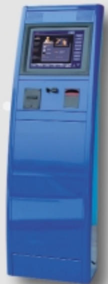
Transactional kiosk with Bank Note Acceptor, Receipt Printer and Card Reader