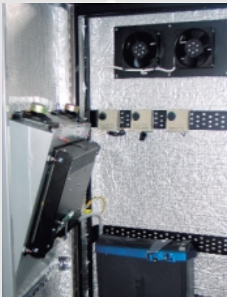
Demonstration of the Climate Control Unit in the outdoor Hawk