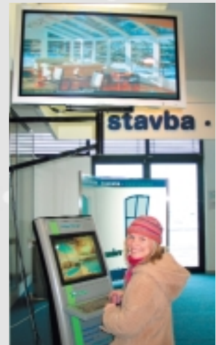
Eagle with 40" Plasma Screen - retail application