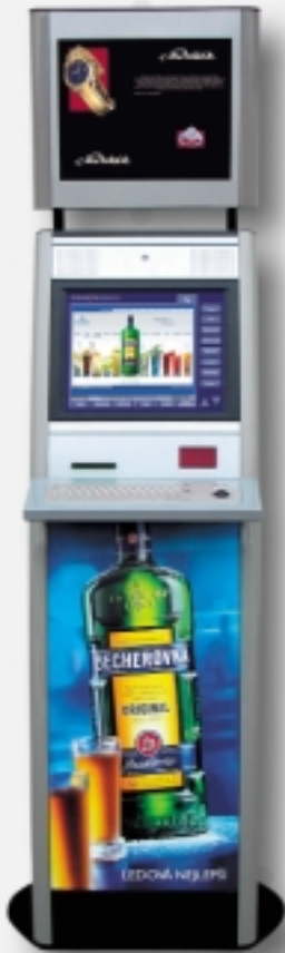
< Marketing & Advertising kiosk solution, suitable for Retail and Promotional applications