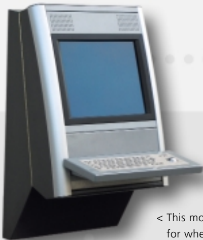
< This model is also suitable for wheelchair users.