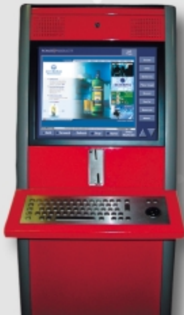
< Eagle with Camera and Coin Selector