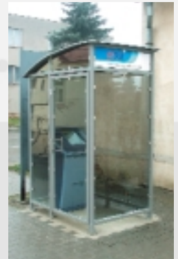
Application examples >

The Eva kiosk is complemented by the Eva Booth which allows the user to take full advantage of all the system features. There are several Eva Booth models to cover all requirements (indoor and outdoor use and 24/7 availability).