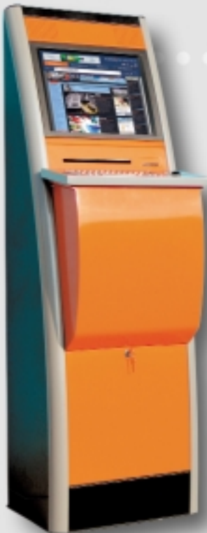
< Eagle with Laser Printer, Chip Card Reader and Keyboard with Trackball