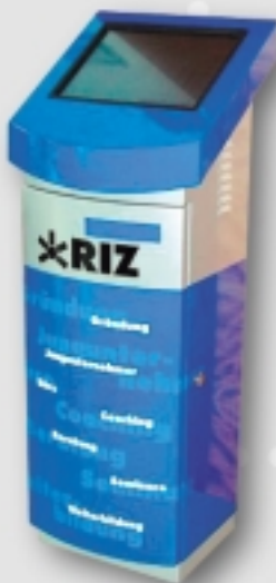
Heron with customized Graphics