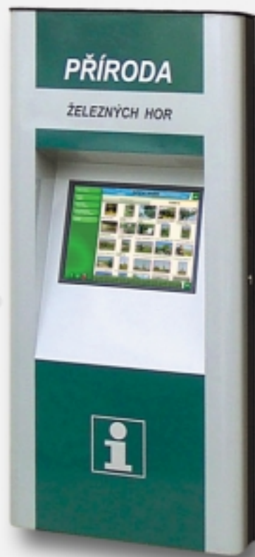
Wall mounted version