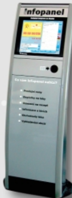
< Eagle with Bar Code Reader and Moving Sensor - pharmaceutical application